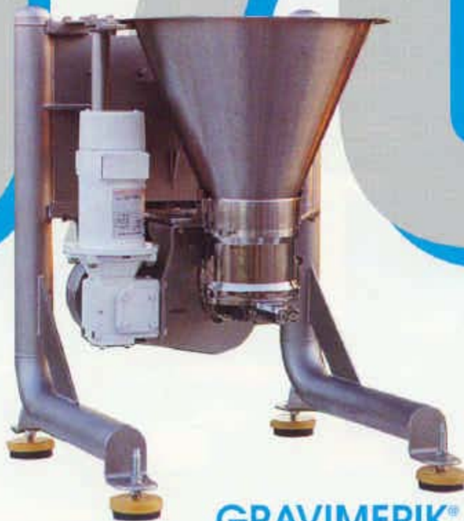
GRAVIMERIK® Model 570 Loss-in-Weight Feeder